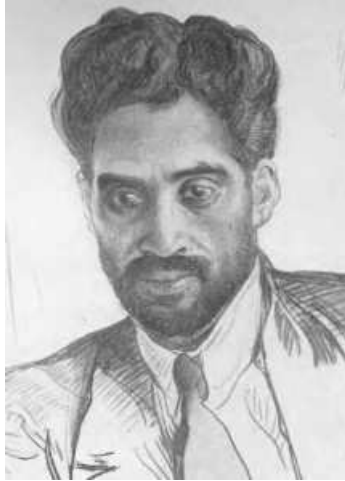
Manabendra Nath Roy

They had little knowledge, however, of the anti-colonial freedom movements that began to emerge at that time. It was not until the Russian revolution of 1917 that an alliance was forged between revolutionary socialism and the colonial freedom movement.