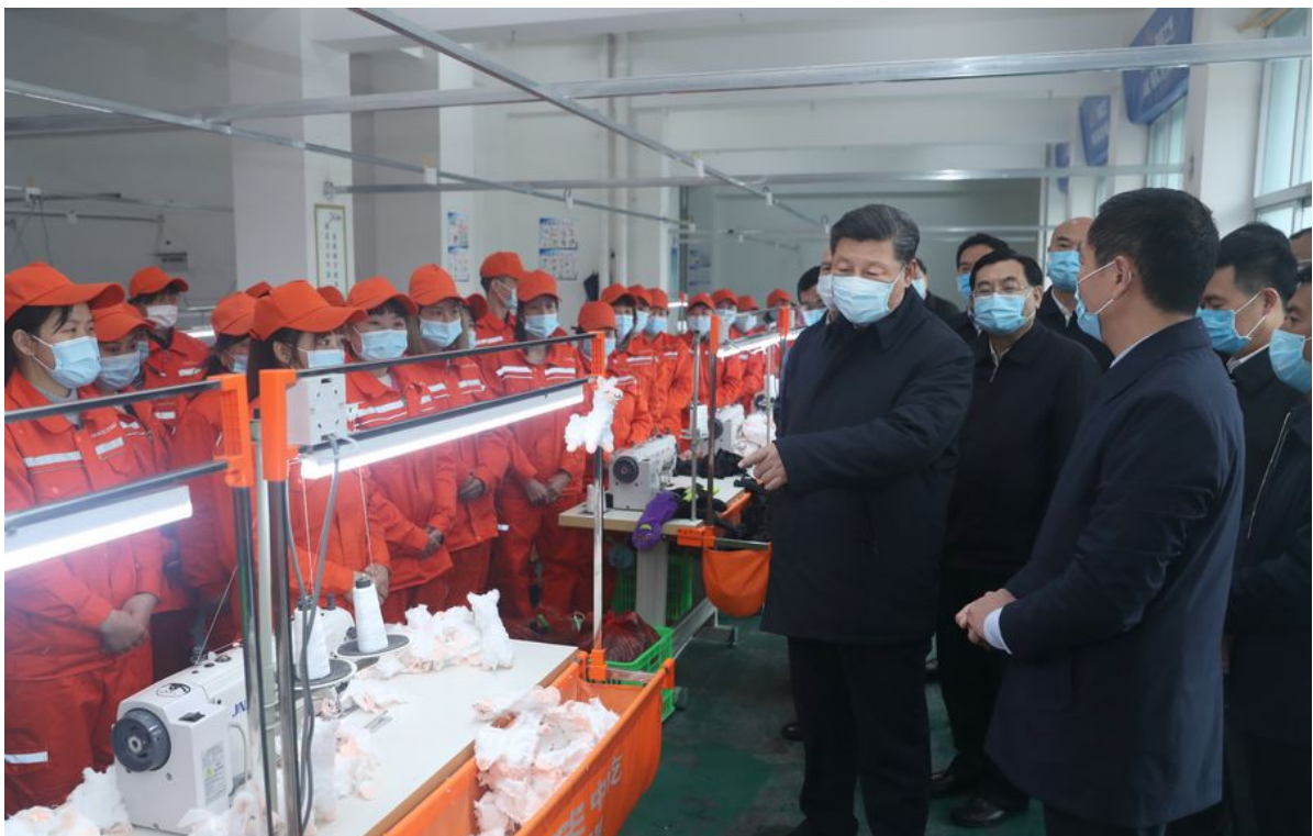
Chinese President Xi Jinping learns about employment for relocated people during an inspection in a stuffed toy workshop in Jinping Community of Laoxian Township, Pingli County of the city of Ankang, northwest China's Shaanxi Province, April 21, 2020.

As of mid-April, about 84 percent of SMEs have resumed businesses, data from the Ministry of Industry and Information Technology showed.