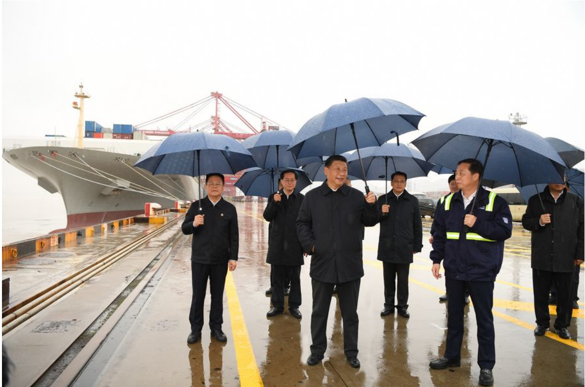
Chinese President Xi Jinping visits the Chuanshan port area of the Ningbo-Zhoushan Port in east China's Zhejiang Province, March 29, 2020.

While the positive momentum in China's epidemic prevention and control is being consolidated, the task remains formidable, requiring control measures on a regular basis and strengthened efforts to guard against both imported infections and domestic rebounds, according to a recent meeting of the Political Bureau of the CPC Central Committee chaired by Xi.