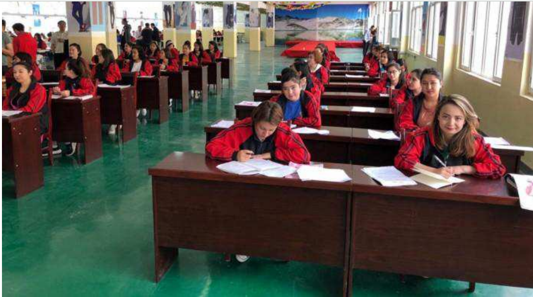
Uighur detainees at a detention facility in Kashgar take vocational classes. All the detainees in this class admitted to having been “infected with extremist thoughts.”

This piece from National Public Radio, a premiere US progressive platform, was written after their reporters visited XinJiang and conducted many interviews. It uses language to try very hard to spin the story against China, but none the less clearly illustrates that the so called “concentration camps” are nothing more than schools. The students are common criminals as well as those with known connections to fundamentalist extremism, and they go home on the weekends.