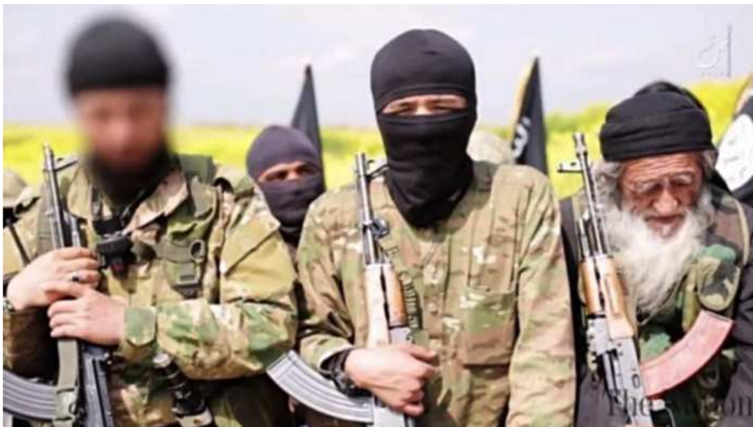
Uyghur Jihadist Militants Trained in Syria

Since 2000, there have been more than 200 violent terrorist incidents in Xinjiang and beyond, as part of a long term destabilisation campaign conducted by the US against China.