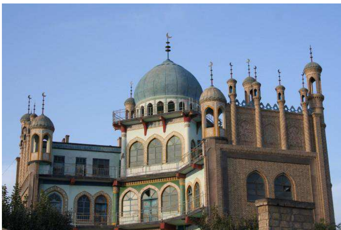
Mosque in Kashgar

The emotional narrative fits perfectly with the sense of injury and outrage against injustice so prevalent today (most of it of course entirely justified). By mixing the totally fraudulent with the legitimate, the war-mongers are experts at positioning their well-crafted lies to best tug at the heart-strings of good people.