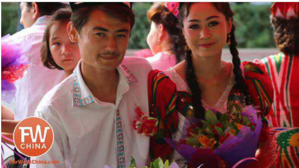
Traditional Uyghur Dress and Style

In Tajikistan and Kazakhstan, both of which have experienced religious extremism as a result of spread of Wabbabism, their Muslim extremists have gone to fight alongside IS against the Syrian government, they have repressed extremism by cutting off beards, closed down shops selling burqa, and ban Arabic sounding names.