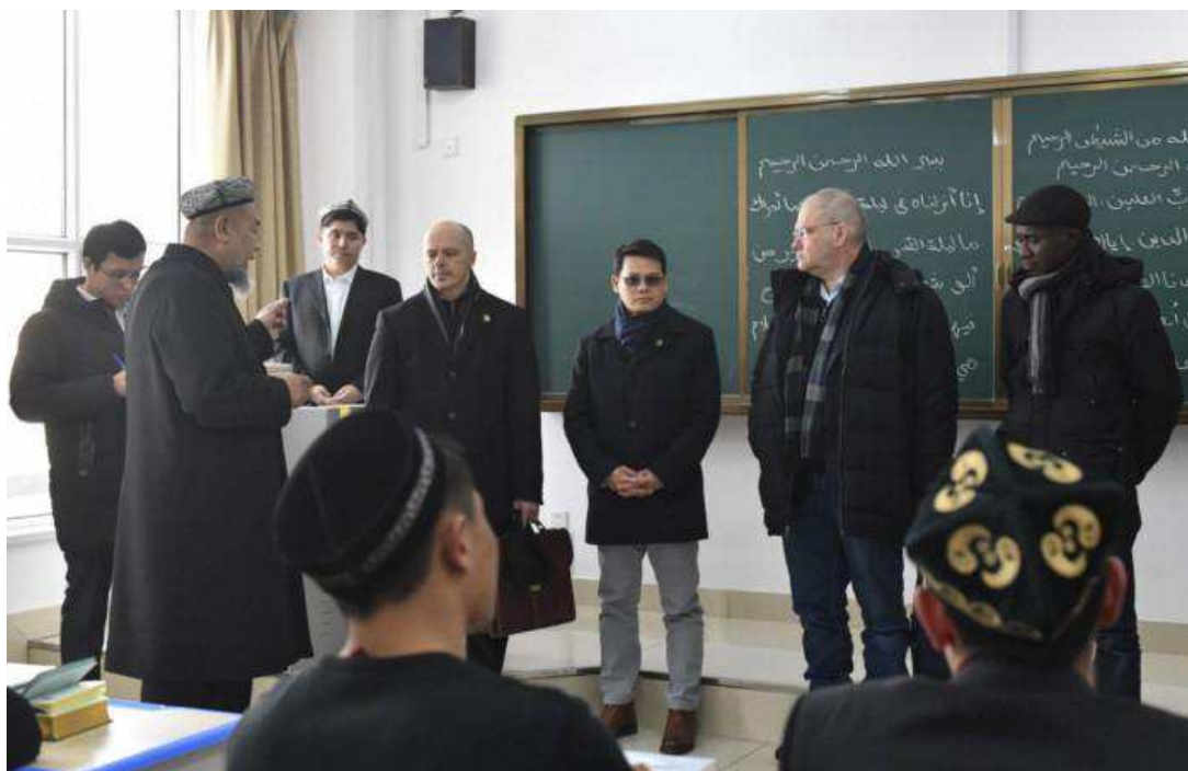
Senior diplomats from foreign countries visit an Islamic institute in Urumqi, Xinjiang Uygur autonomous region, on Feb 16, 2019. They represent their countries in the United Nations office in Geneva, Switzerland.

“Calls have grown in the West to pressure President Xi Jinping’s government to stop the alleged human-rights abuses against the Uighurs. U.S. politicians have proposed freezing the travel and assets of top Chinese officials including Xinjiang Communist Party chief Chen Quanguo. But it has so far escaped serious criticism from officials in the Islamic world, leading U.S. Secretary Mike Pompeo to blast Iran’s Supreme Leader Ayatollah Ali Khamenei for not speaking out.”