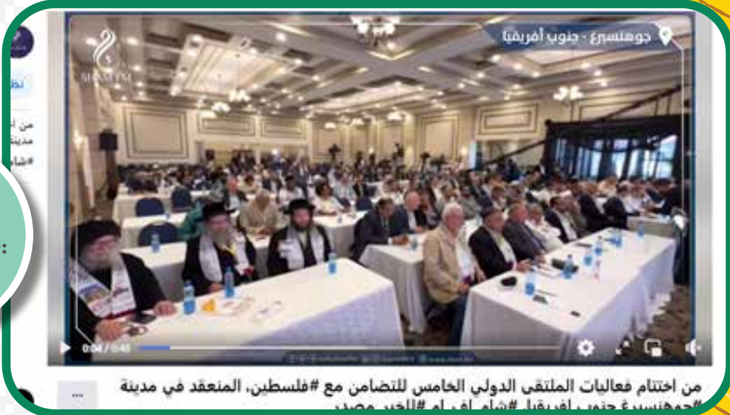
Channel: Sham FM Coverage type: News Report