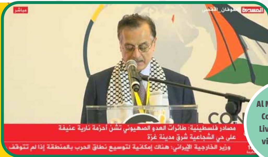
Channel: Al Masira Channel Coverage type: Live broadcast + video reports + interviews