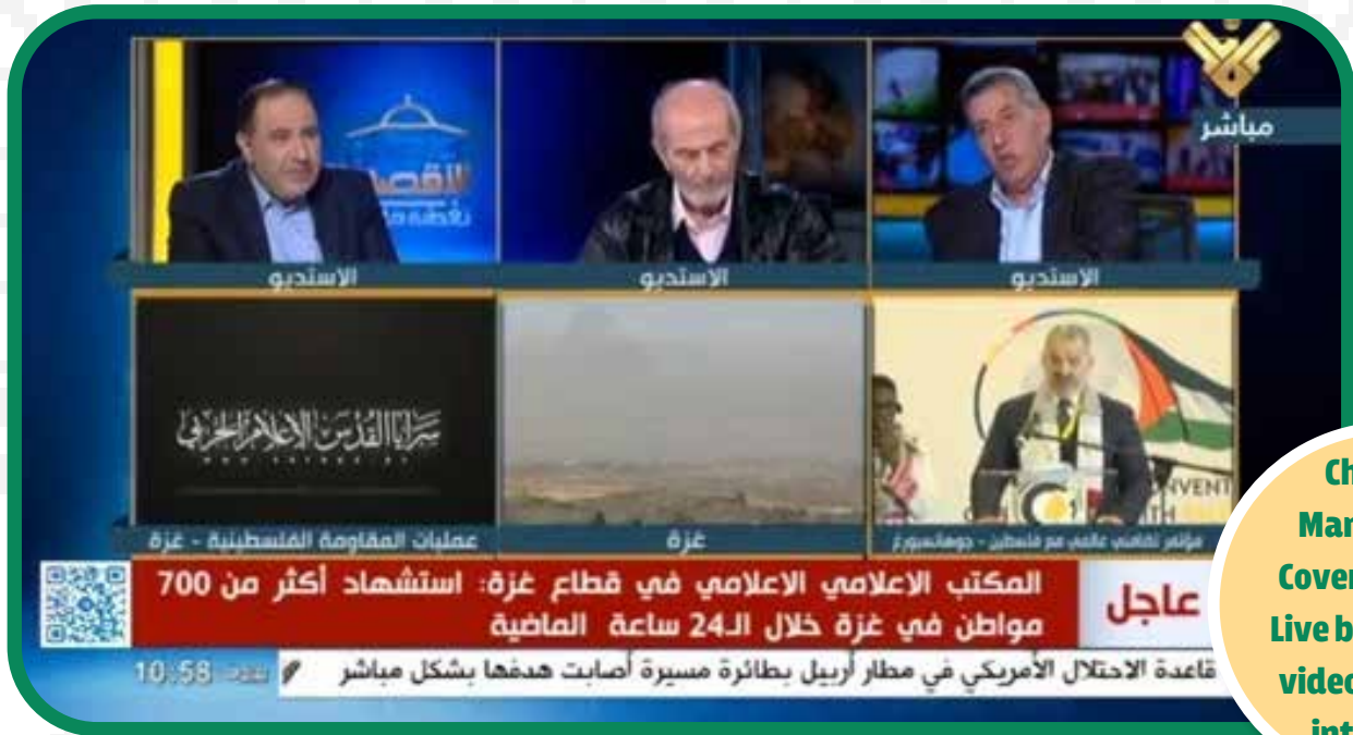
Channel: Manar News Coverage type: Live broadcast + video reports + interviews