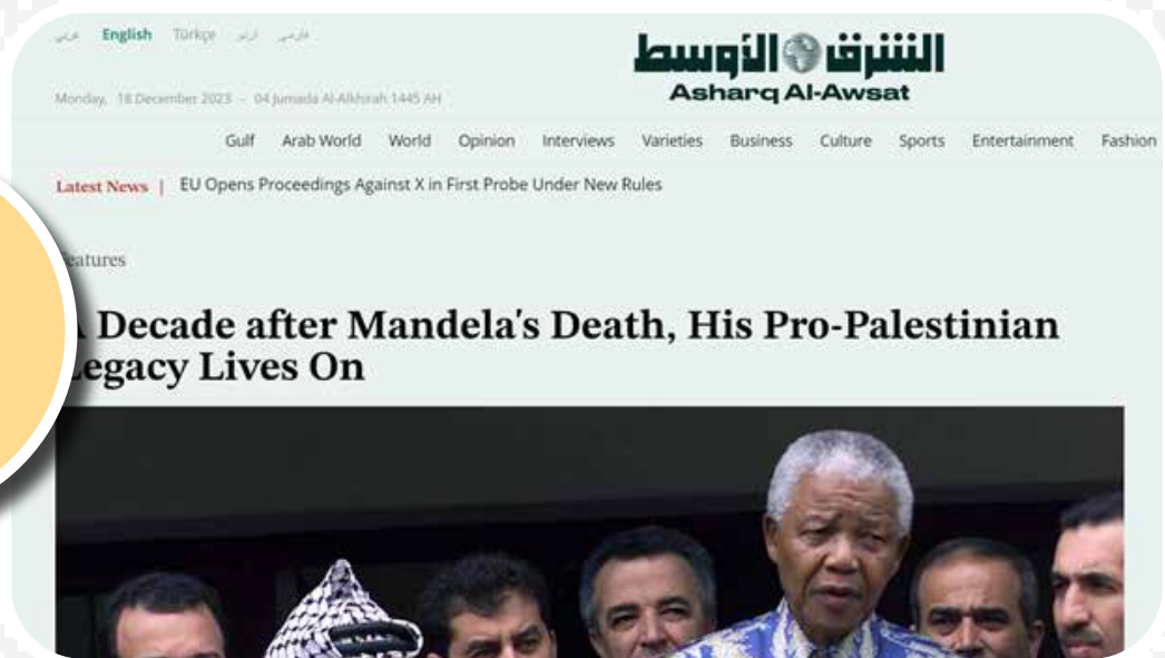
Channel: Middle East Magazine Coverage type: News Report