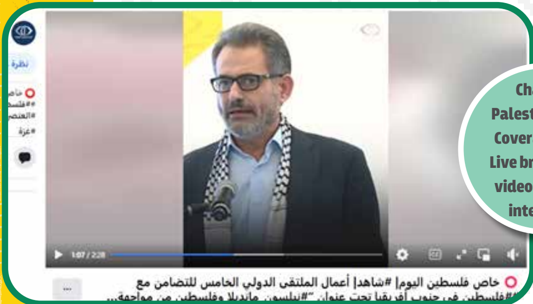
Channel: Palestine today Coverage type: Live broadcast + video reports + interviews