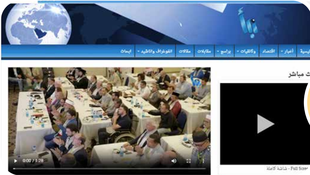
Channel: Nabaa Channel Coverage type: News Report