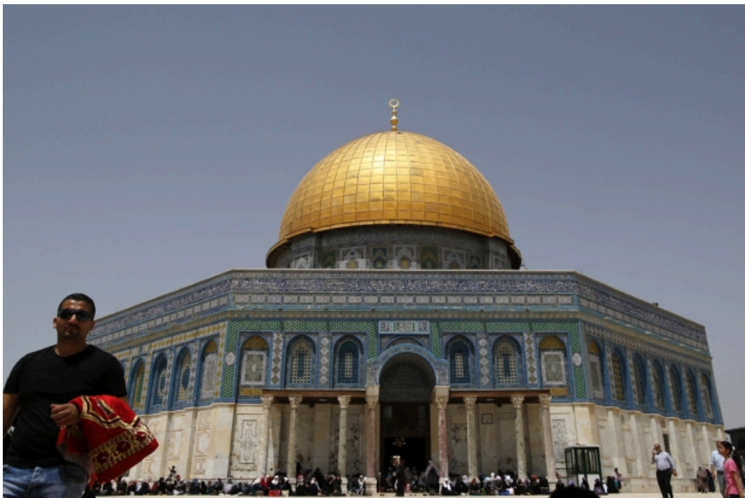
Palestinians near the Dome of Rock shrine at al-Aqsa Mosque on April 21

11. The blessed al-Aqsa Mosque belongs exclusively to our people and our Ummah, and the occupation has no right to it whatsoever. The occupation's plots, measures and attempts to judaize al-Aqsa and divide it are null, void and illegitimate.