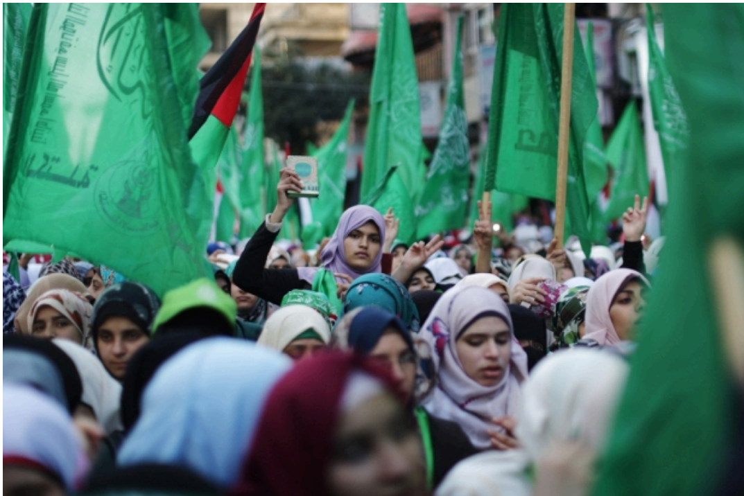
Palestinian women protest in support of Hamas in Gaza

34. The role of Palestinian women is fundamental in the process of building the present and the future, just as it has always been in the process of making Palestinian history. It is a pivotal role in the project of resistance, liberation and building the political system.