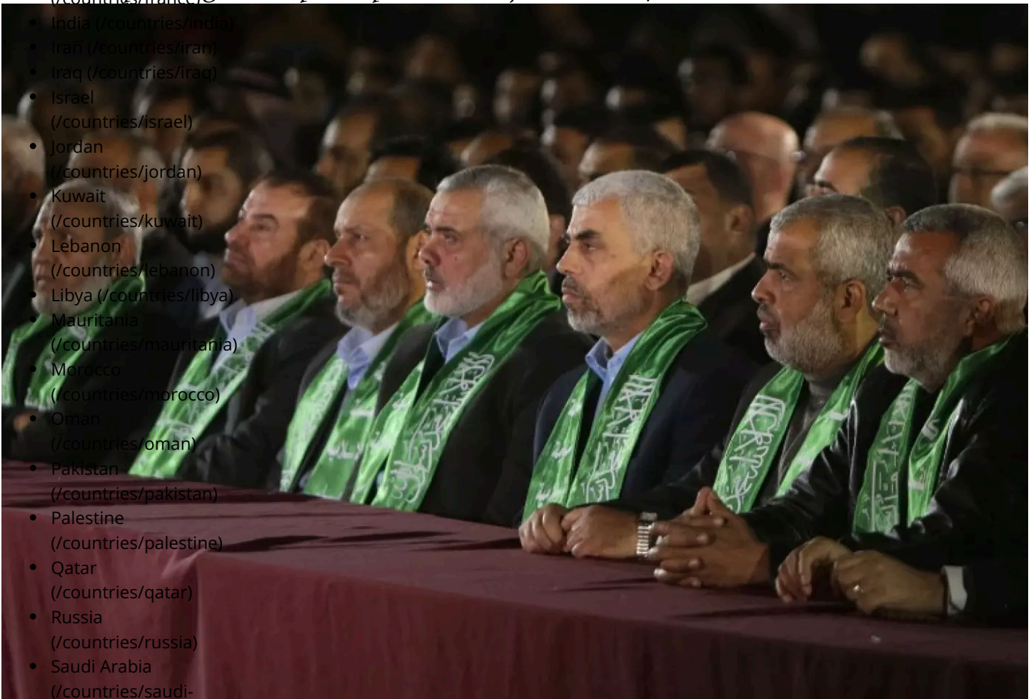
Yahya Sinwar, leader of Hamas in Gaza, and senior political leader Ismail Haniyeh on 27 March

Hamas explains general principles and objectives in 42-article document