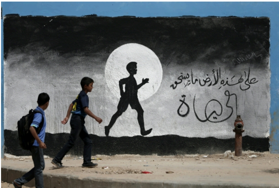
Palestinian boys walk past graffiti on a wall of the UN school of Beit Hanoun Gaza

23. Hamas stresses that transgression against the Palestinian people, usurping their land and banishing them from their homeland cannot be called peace. Any settlements reached on this basis will not lead to peace. Resistance and jihad for the liberation of Palestine will remain a legitimate right, a duty and an honour for all the sons and daughters of our people and our Ummah.